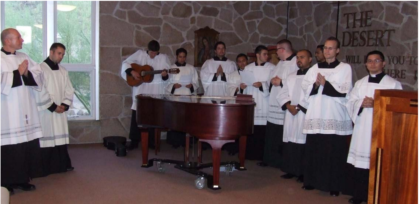
Seminarians from the Tucson Diocese Seminary performed as the choir.