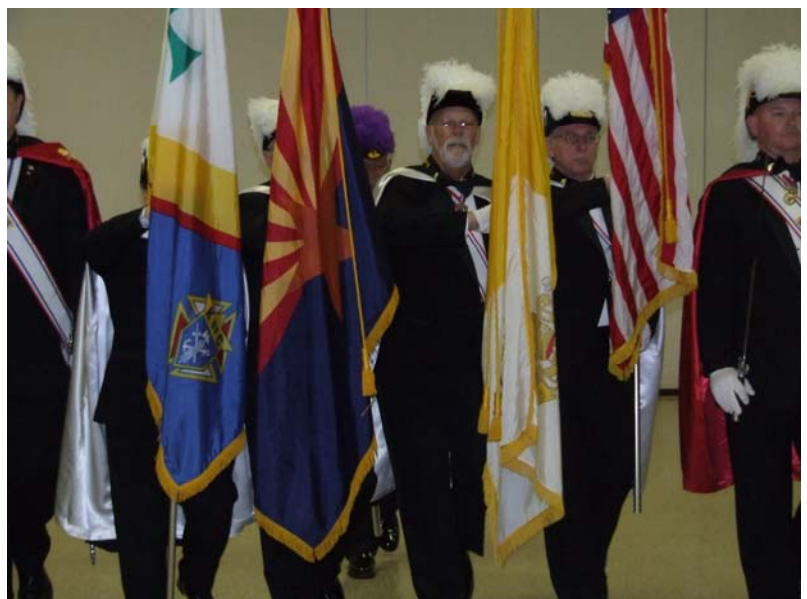
The Assembly 2308 Color Corps presented colors. Unfortunately, most of the members are hidden behind their flags.