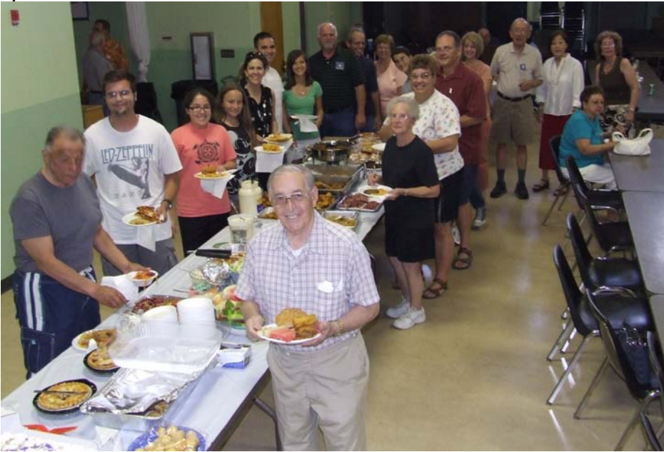
There was a good turnout for Family Night.