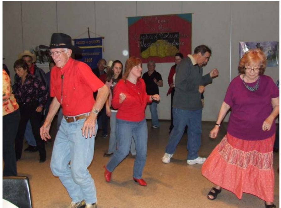
Maybe they know what they're doing — maybe they don't!