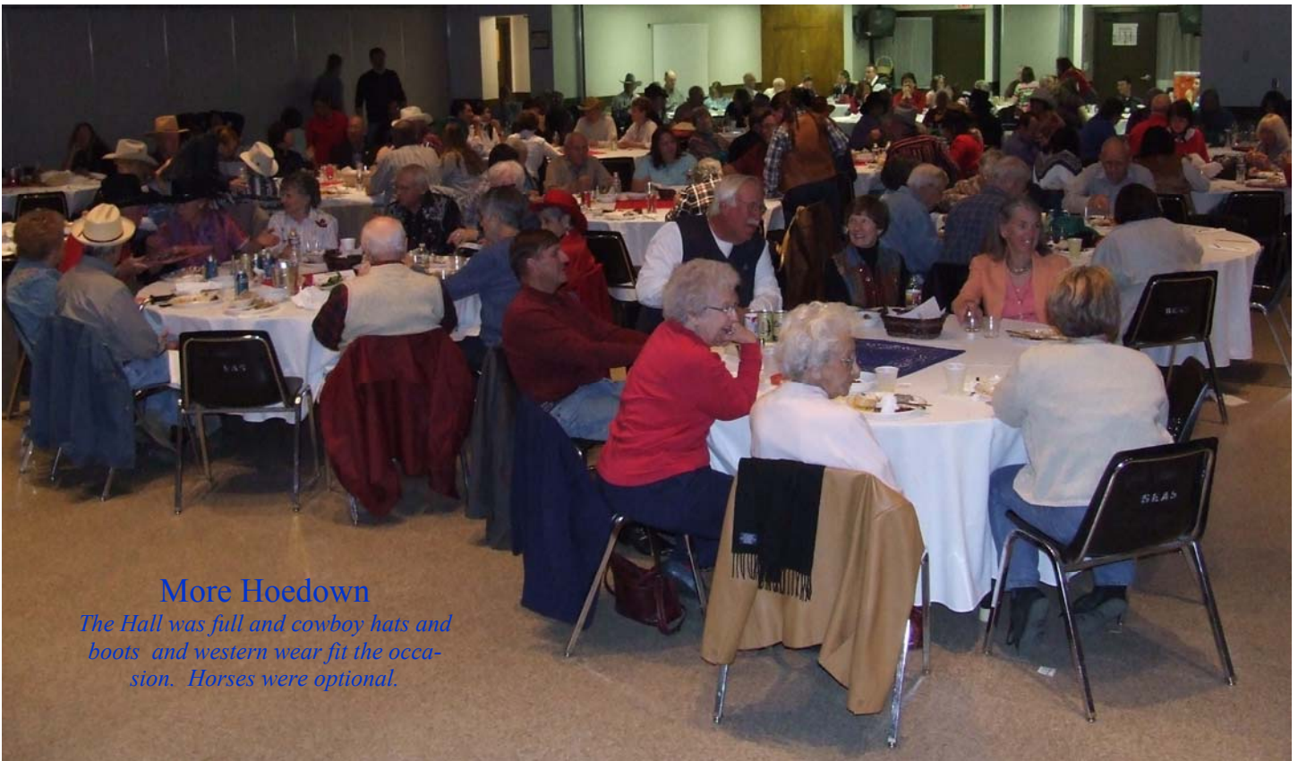
More Hoedown The Hall was full and cowboy hats and boots and western wear fit the occasion. Horses were optional.